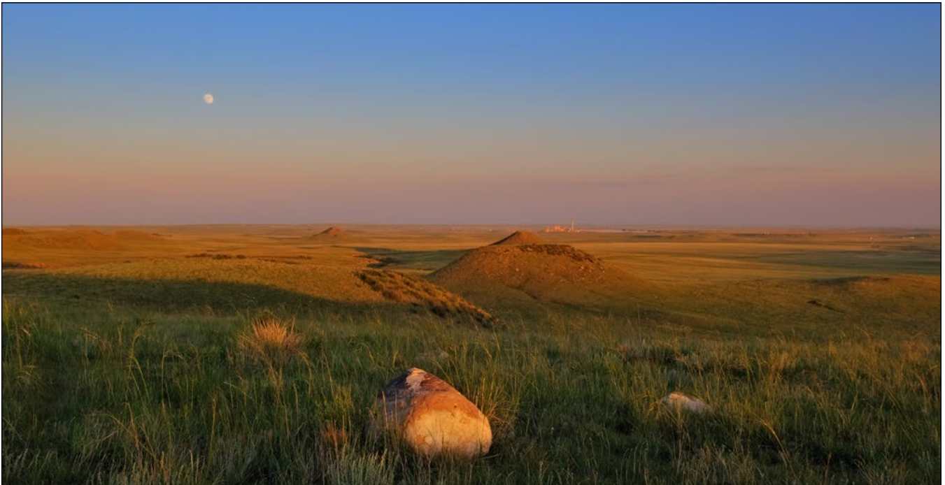
Moonrise over Soapstone Prairie

Land conservation efforts in Colorado target ecologically important areas and provide a significant economic stimulus to the State's economy and tangible benefits to its residents. Given the perpetual nature of conservation easements, these benefits are expected to continue to accrue into the future and increase on a per-acre basis due to Colorado's increasing population and wealth and decreasing supply of open lands. These findings suggest past and current land conservation efforts are sound economic investments benefiting current and future Colorado residents.